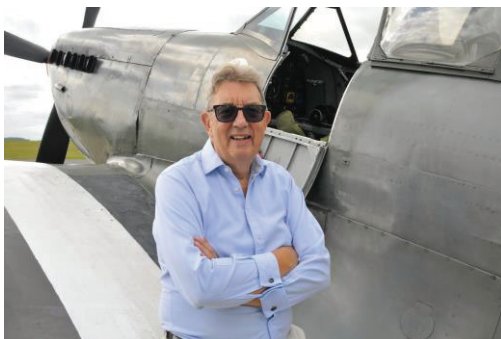
PAUL BEAVER, HISTORIAN

This splendid occasion in 1919 was marked by the appearance of Southampton’s Mayor, Sidney Kimber who brought the City Corporation, the Mayor of Winchester, Arthur Dyer and other prominent local figures to the Royal Pier to witness the Southampton-Cowes flying boat service. The councillors were flown around and over Southampton in the Channel flying boats. When he landed Councillor Kimber declared that Southampton Water was the world’s first Air Port. Within days, the Channel flying boats were taking passengers to Bournemouth, Southsea and a few weeks later, the Channel Islands and France. Air travel seemed to have arrived!